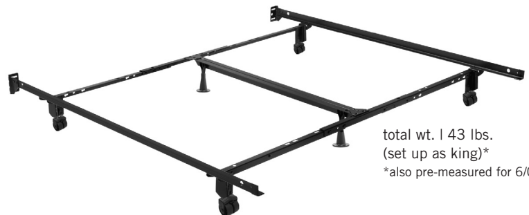
total wt. | 43 lbs. (set up as king)* *also pre-measured for 6/0