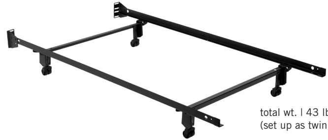
total wt. | 43 lbs. (set up as twin)

10" Hi-Riser GL10 Glide (C.) - kit sold separately