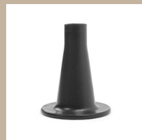
Hercules™ plastic glides for sturdy support