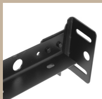
headboard brackets heavy duty construction; riveted; fits virtually all headboards

adjusts to 3/3, 4/6, 5/0, 6/6 or 6/0 total wt. | 32 lbs.