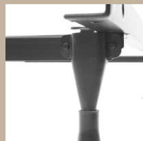
locking legs creates a triple-thick steel layer at the corners; recessed for safety